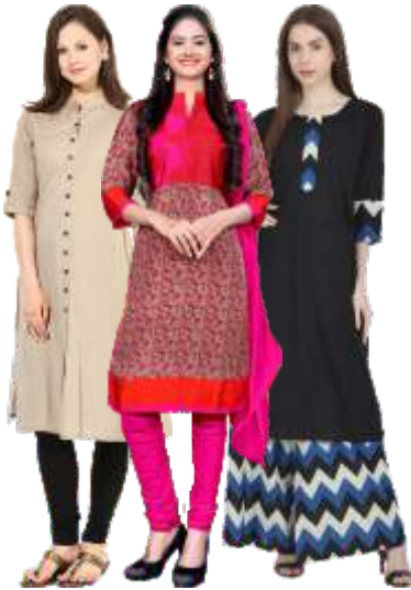
Kurta, Churidar, Plazzo